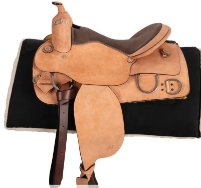
LIGHTWEIGHT WORK SADDLE